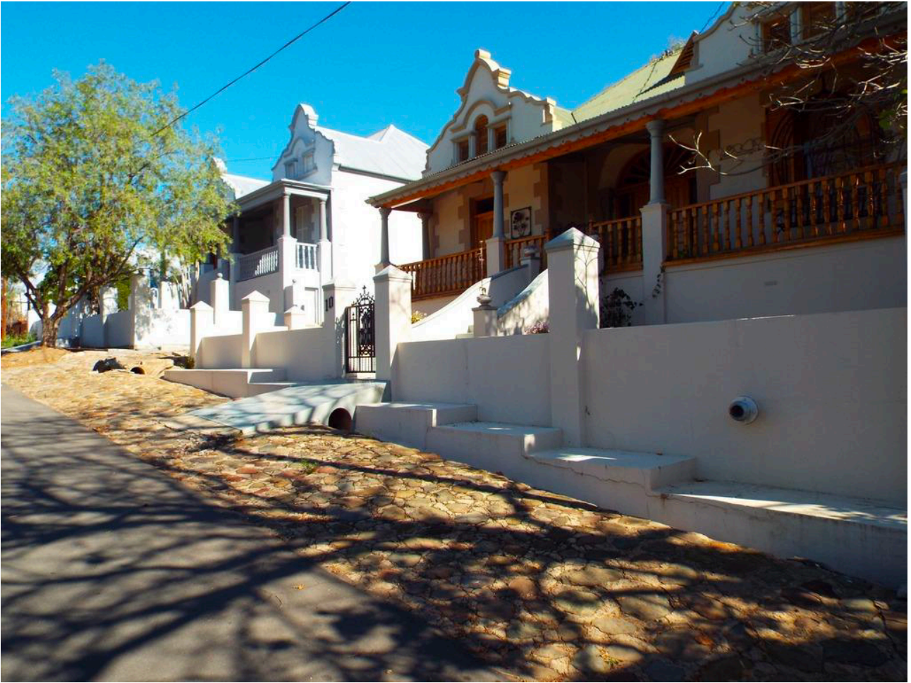
The Twin Houses – 5 th Avenue: These “twin houses” were built by two brothers who split an original large stand into two and built two identical houses side by side in 5 th Avenue. The facades are the same but the back sections differ as they have been added to by different owners over time.