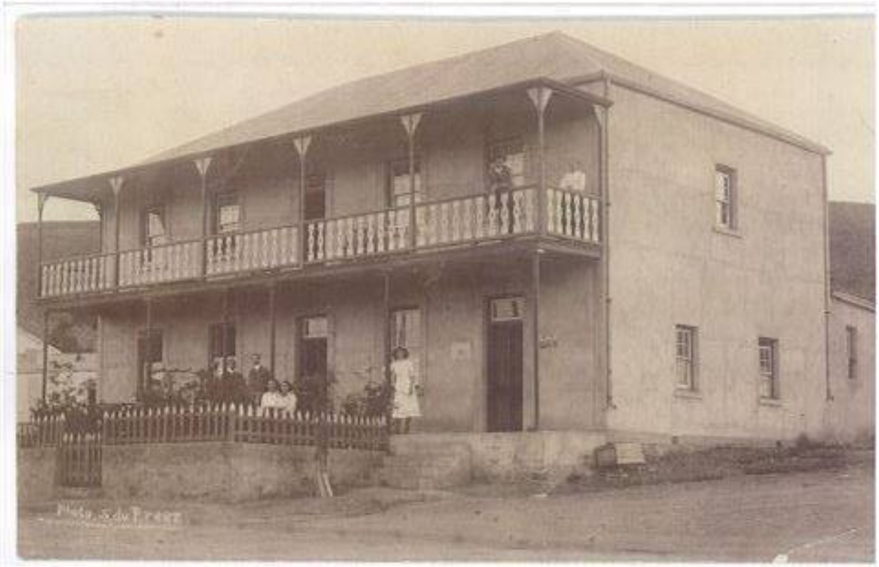
The Orphanage which was built to accommodate the orphans from the Flu Epidemic of 1918 and which was demolished in the 1970's.