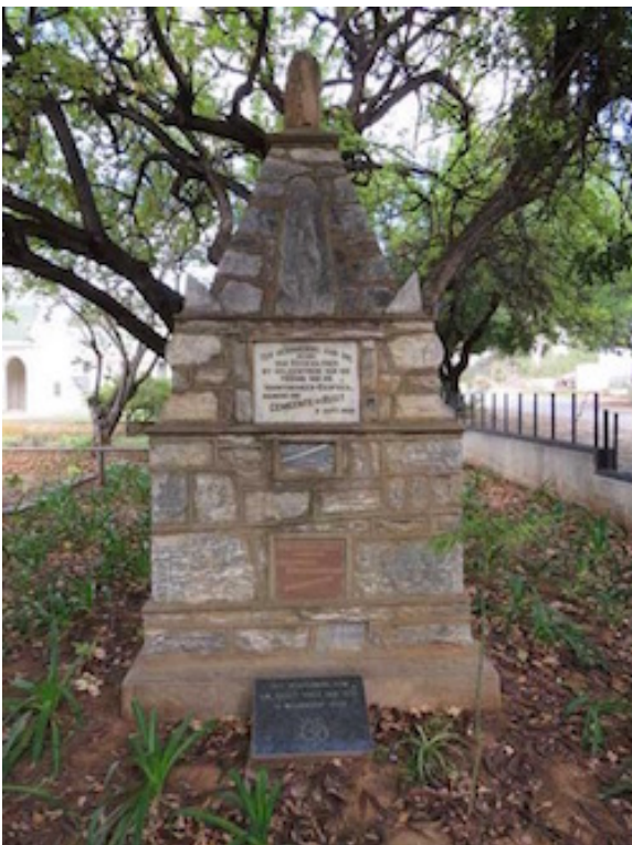
Voortrekker Memorial in the NG Church Grounds

General directory of United South Africa listed him as working in Port Elizabeth in 1915. (From artefacts.co.za).