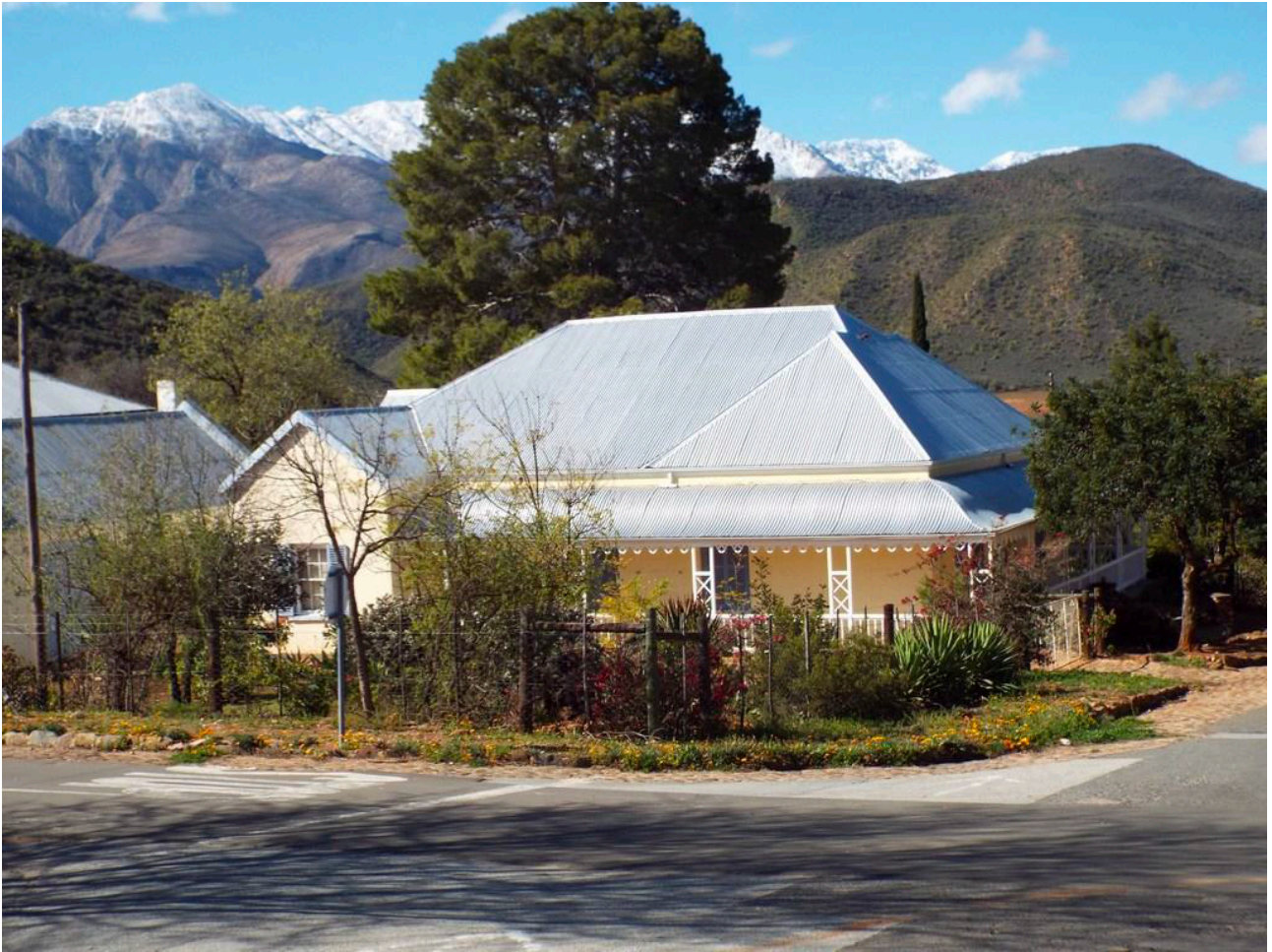
Old Victorian House on the Corner of Le Roux and Hoop Streets: This is also a early 1900's vintage house which has been well maintained by previous owners. Properties in this part of the Village are generally from the early 1900's and were used by farmers in the District when they came to "town". Note snow on the Swartberg Mountain range in the background – 9 Sept. 2018.