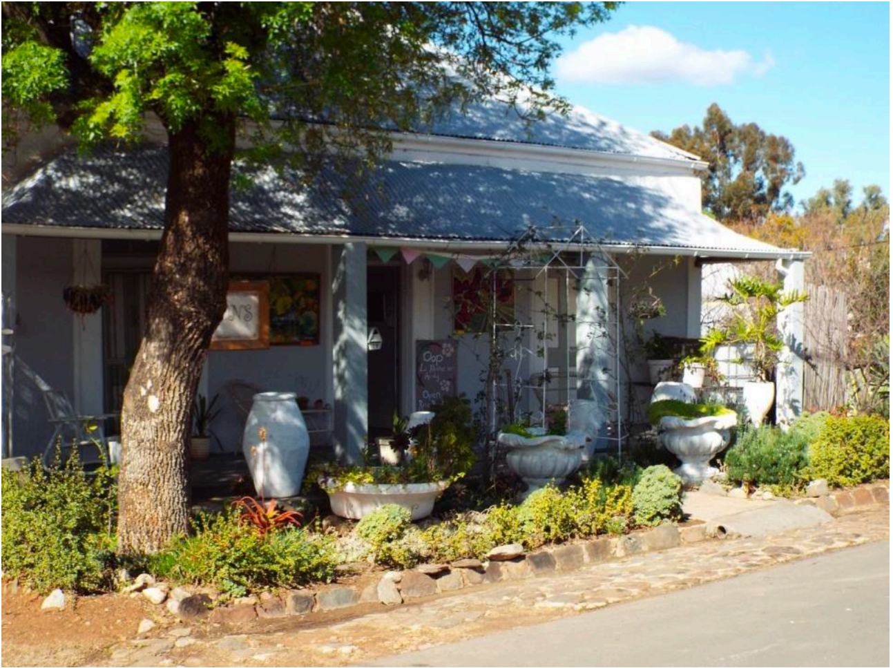
The “Ou Koshuis” in Hoop Street: The old boarding hostel has recently been spruced up as it was in a very run-down condition. This building has not been a school hostel for many years and is now an Art Gallery and residence.