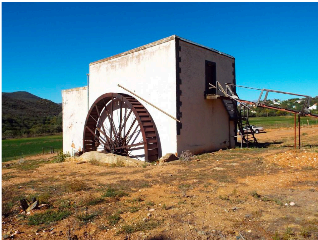
The Old Mill was built in the mid-1800's prior to the Village being established. It continued to operate into the mid-1940's but has subsequently fallen into