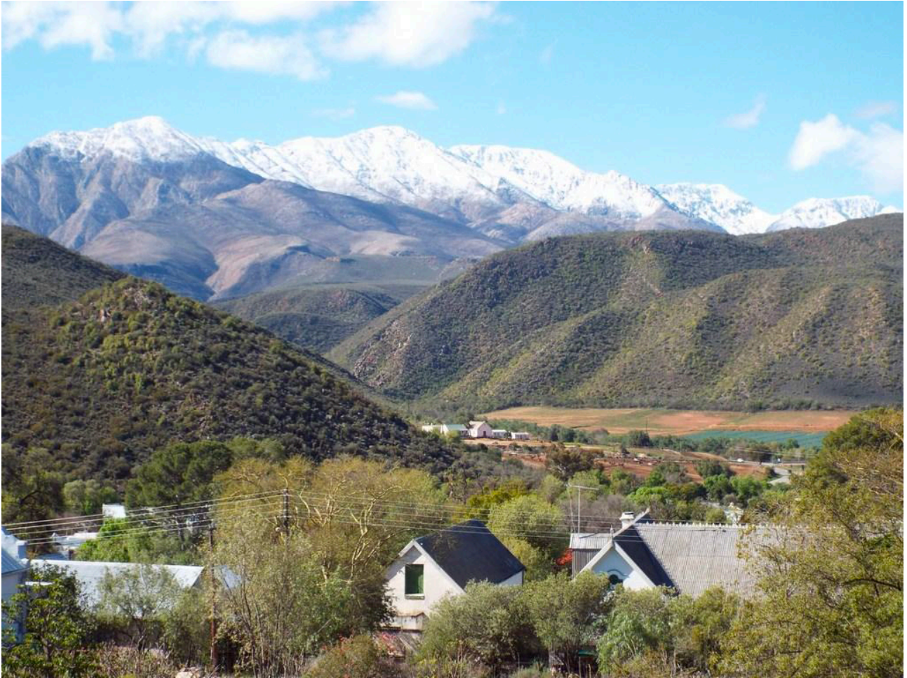
View of the Village from above 5 th Avenue looking North to Meiringspoort showing the snow on the Swartberg Mountain Range – 9 September, 2018