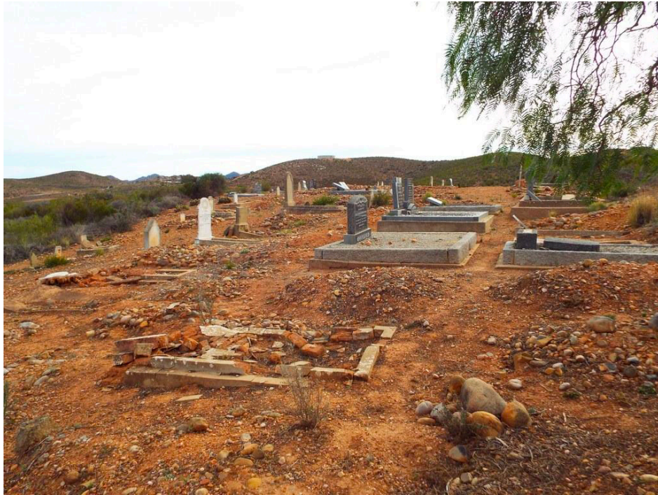
The Old Graveyard: Situated on the De Rust Koppie and this was the original graveyard for the Village for many years. However, during the 20 th Century its use was discontinued and it has fallen into a state of disrepair requiring urgent attention by the community. A new graveyard was later established close to the Dutch Reformed Church in the Village.